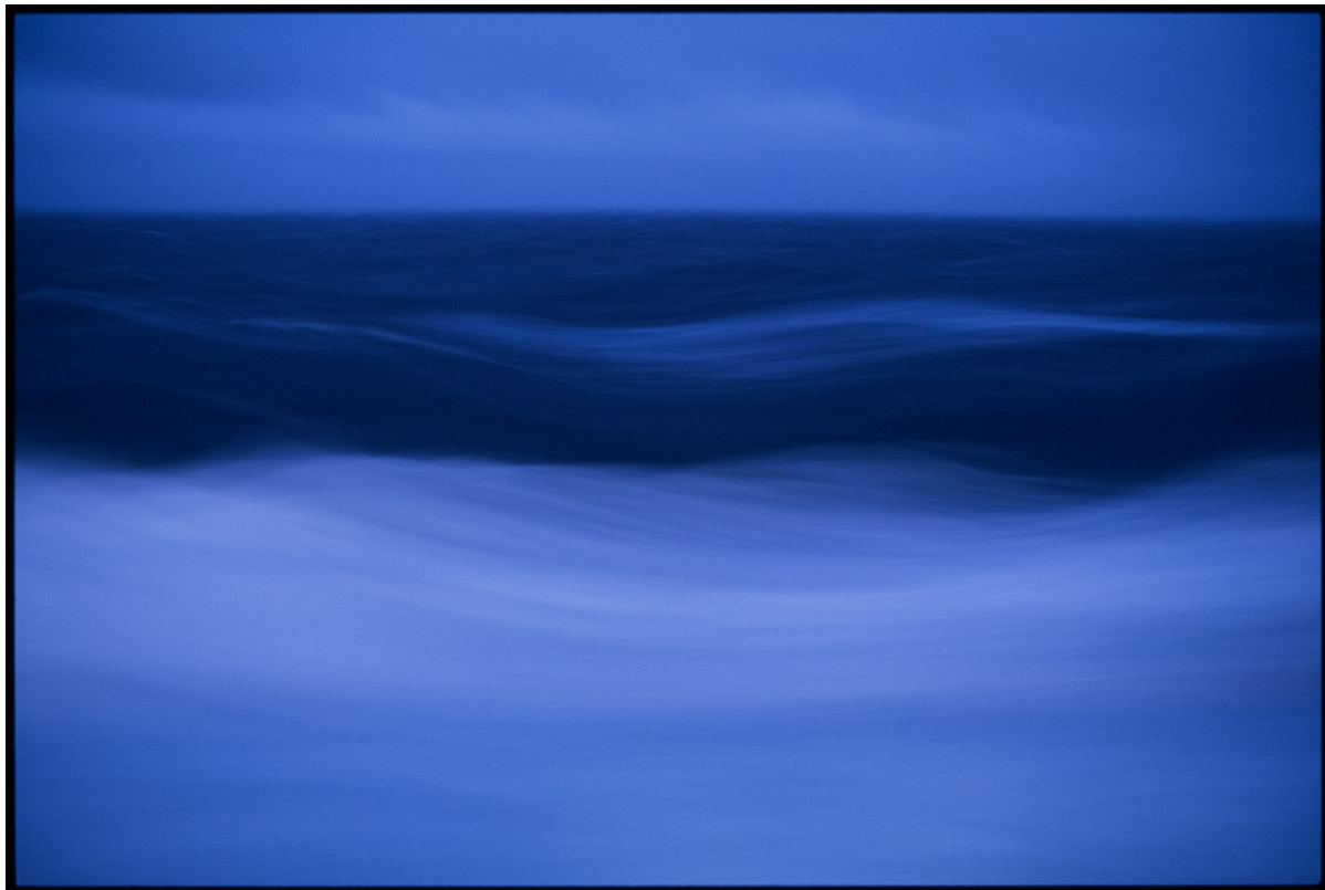
The Crossing – Untitled 19, May 2015